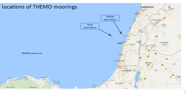
Fig. 1: Locations of the two THEMO moorings

openly shared for view and download on a cloud service. The structure of the THEMO mooring is presented in Fig. 2.